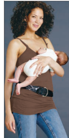
The Glamourmom range is made from Danish green cotton which is harvested without the use of chemical defoliants.

■ The sleeping bags are available from www.urbanbaby.com.au or www.moochie-moo.com.au with prices starting at $49.95.