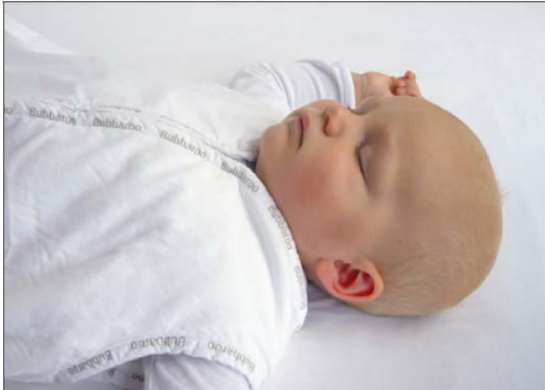
The Bubbaroo sleep range offers a safe alternative to top sheets and blankets for babies and toddlers.